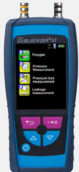
Example on our BLUELYZER ® ST