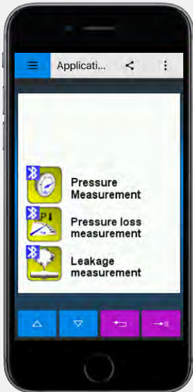
Example on your Smartphone