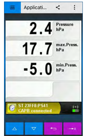
Example for measurement on EuroSoft live app